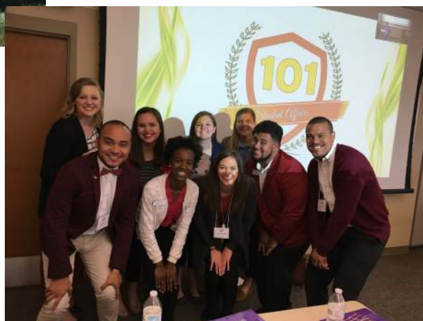
First year students at Student Affairs 101