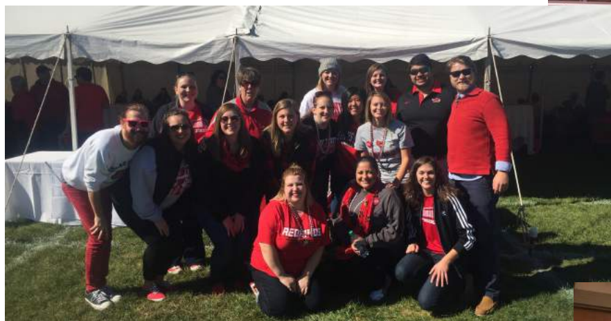
EAF Homecoming 2016