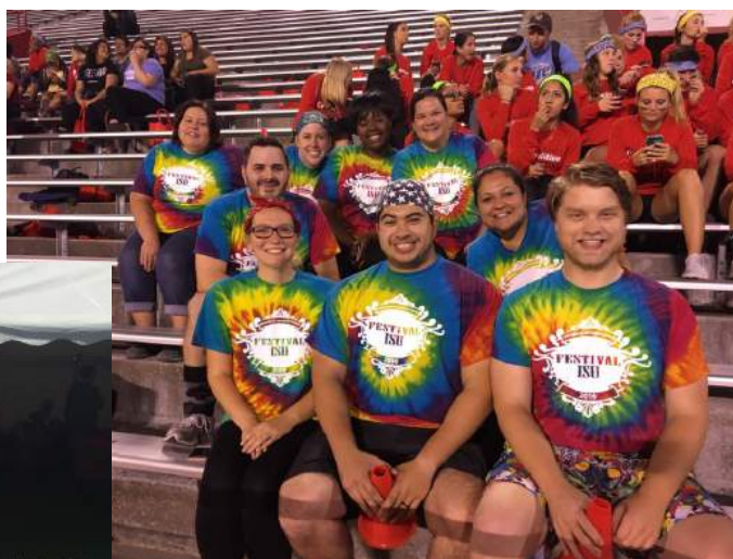
Dean of Students staff at Redbird Rumble