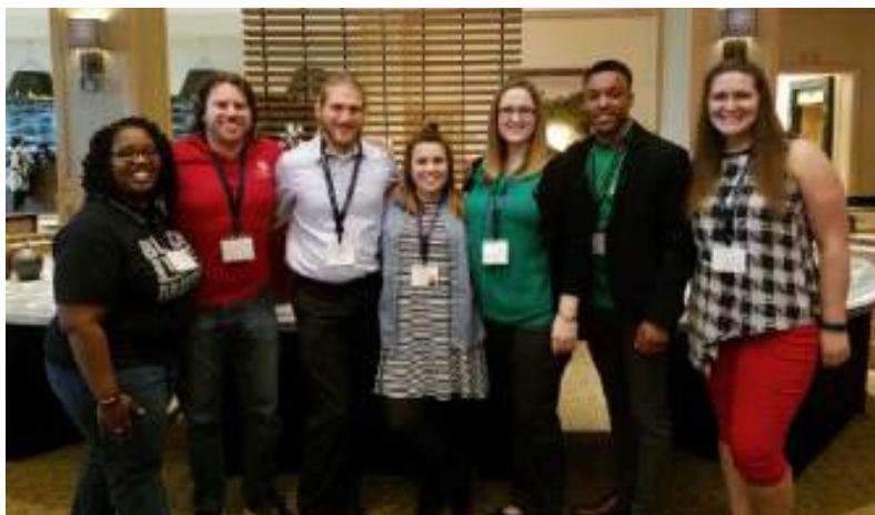
Redbirds at the 2017 Association of Student Conduct Administrators Annual Conference